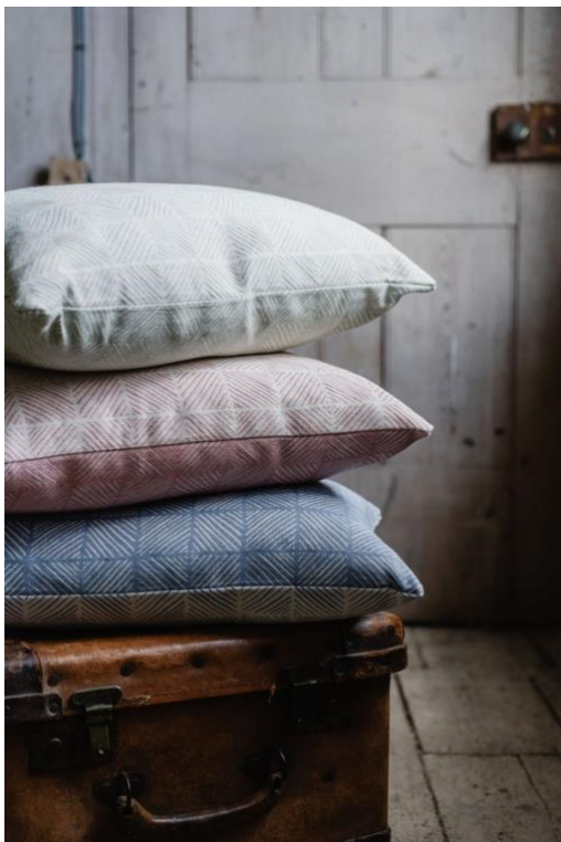
Above Left: Cushions in (from top-bottom) Songlines Water Mint, Songlines Pink Horizon, Songlines Blue Moon.