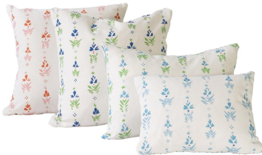
Above: Cushions in (from l-r): Fleur Pink Grapefruit, Fleur Deep Blue & Green, Fleur Blue Lawn, Fleur Blue on Blue.