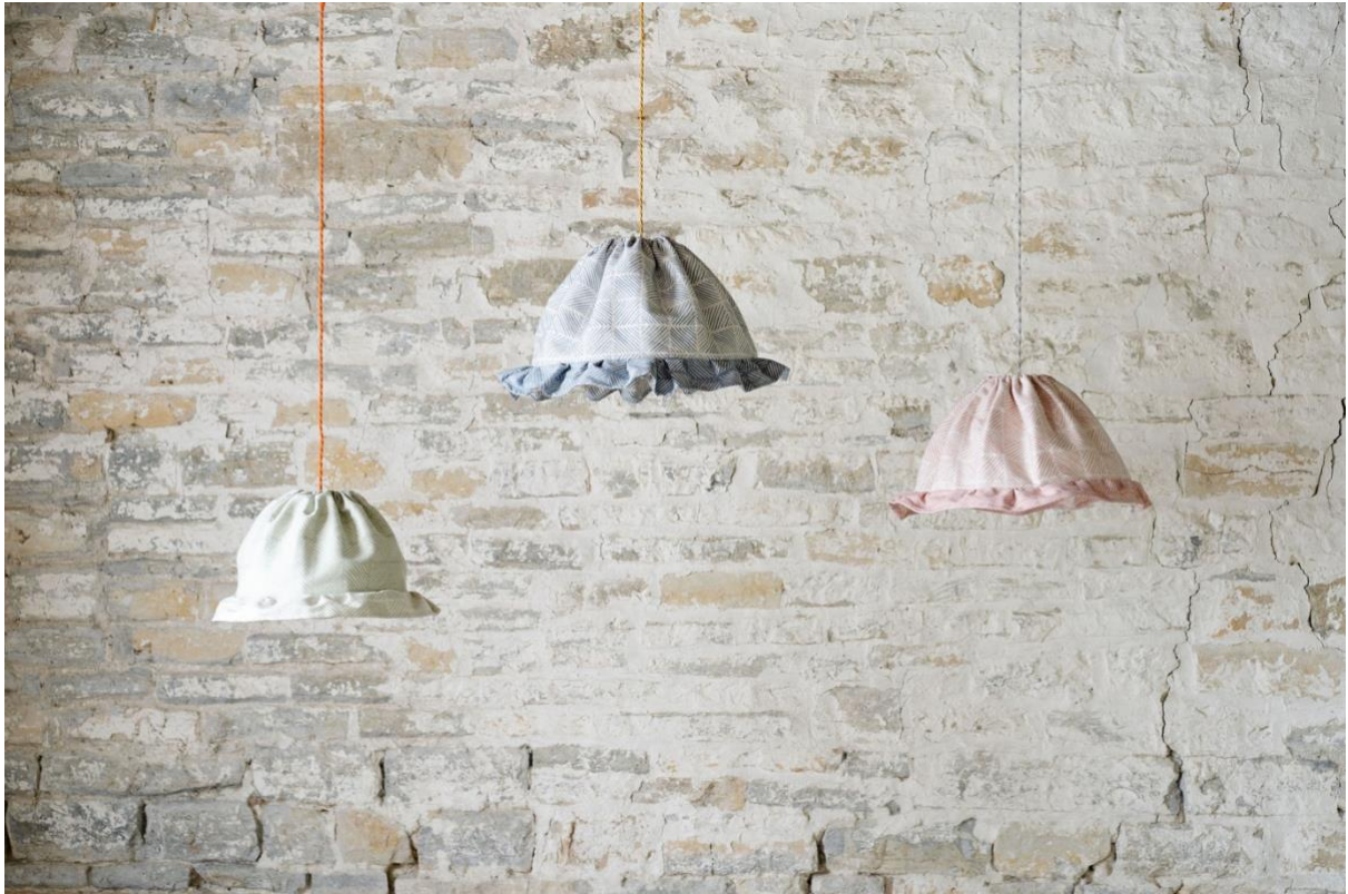
Above: Lampshades in (from l-r) Songlines Water Mint, Songlines Blue Moon, Songlines Pink Horizon.