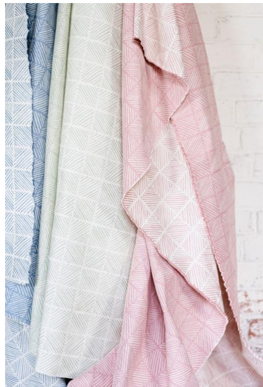
Above Right: Songlines in (from l-r): Blue Moon, Water Mint and Pink Horizon.