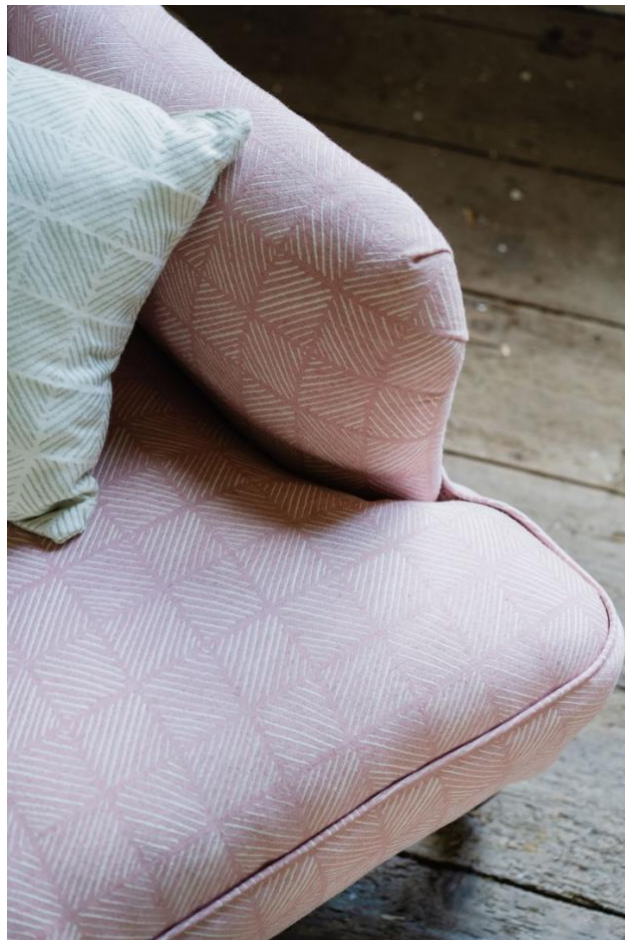
Above: Songlines in Water Mint (cushion) and Pink Horizon (on armchair).