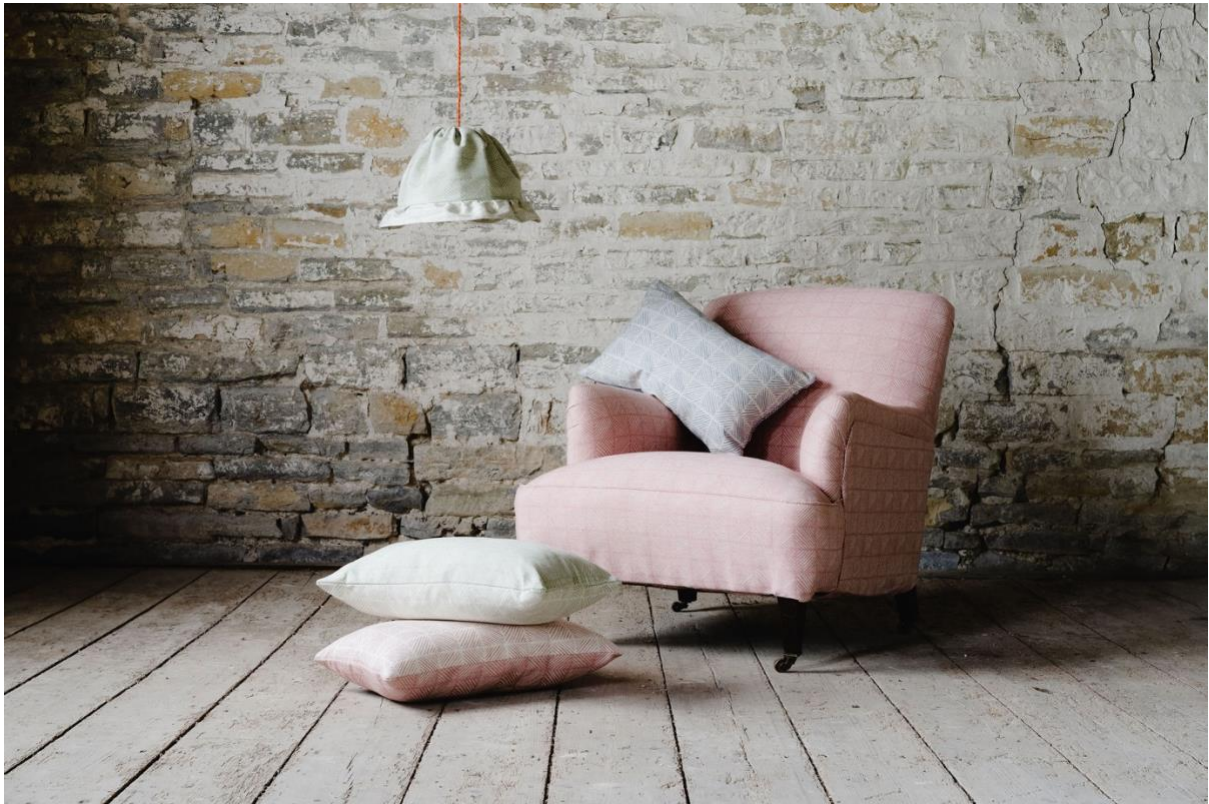
Above: Armchair in Songlines Pink Horizon, cushions in (from top-bottom) Songlines Blue Moon, Water Mint and Pink Horizon. Lampshade in Songlines Water Mint.